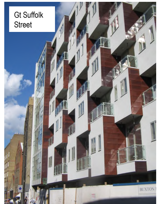
Gt Suffolk Street

A very high thermal performance of 0.23W/m 2 K was achieved using the Epsitec external wall insulation system incorporating 40 mm insulation and silicone render onto a steel frame using drainage cavities. Sun facing balconies were finished in render and rainscreen copper cladding as a major feature. The landlord was Buxton Homes; the architects, Glas Architects and BRD Tech Ltd; the system designer, Wetherby Building Systems Ltd; and the installer, CRL Facades, the latter two members of INCA.